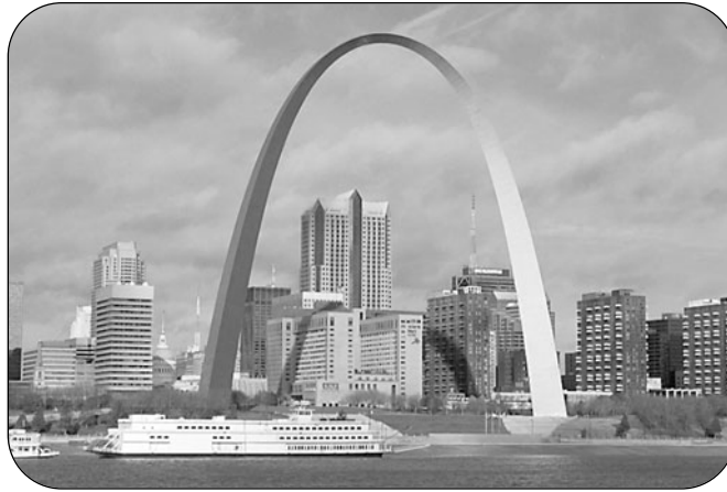
St. Louis, Missouri

You can give the following prayer to be taken at night in your soul consciousness to Archangel Chamuel's home in the heaven-world.