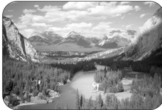
Banff with Lake Louise, Alberta, Canada

You can give the following prayer to be taken at night in your soul consciousness to Archangel Michael's home in the heaven-world.